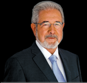
Isaltino Morais Mayor of Oeiras

When I took office as Mayor of Oeiras at the end of 2017, one of the goals that I set out was to bring a new cycle of development for Oeiras. The official launch of the Oeiras Valley project is a historic step towards the mission that we have set ourselves.